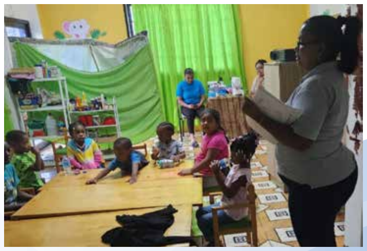
Enchanted Forest Vacation Camp, San Fernando