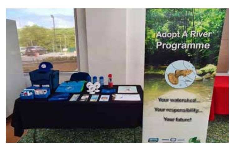
Adopt A River