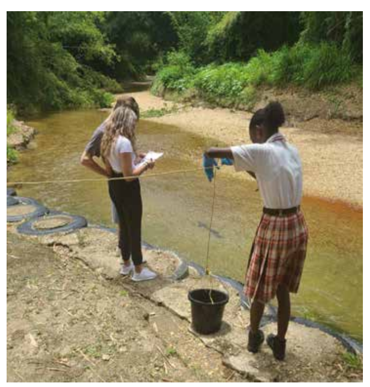
Students Collecting Water Samples