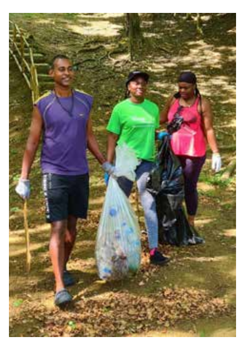
Richmond River, Tobago