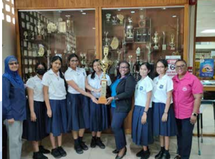
Presentation of Challenge Trophy To Naparima Girls' High School