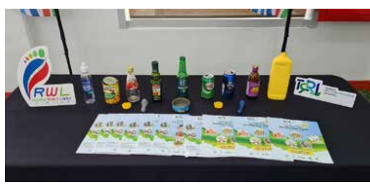
Recycling Waste Logistics