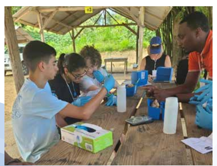
Students Testing Water Samples