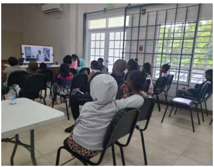
Santa Cruz Police Youth Club