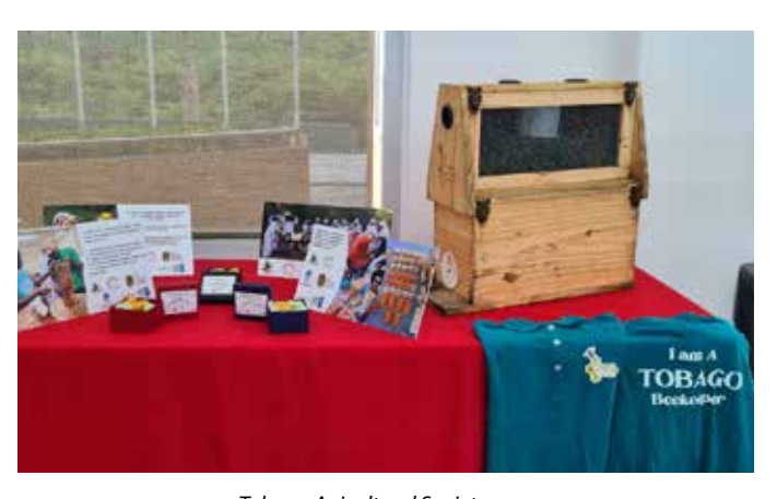
Tobago Apicultural Society