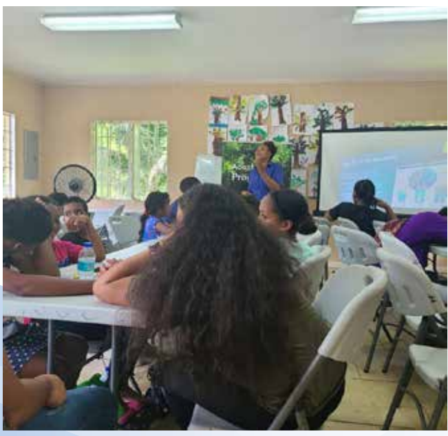
Caura Valley Foundation Vacation Camp