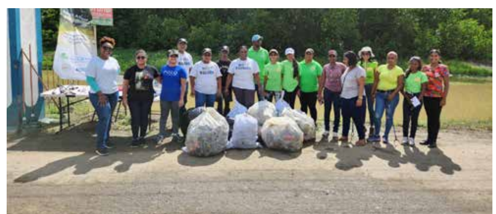
Cunupia River, Felicity Cremation Site