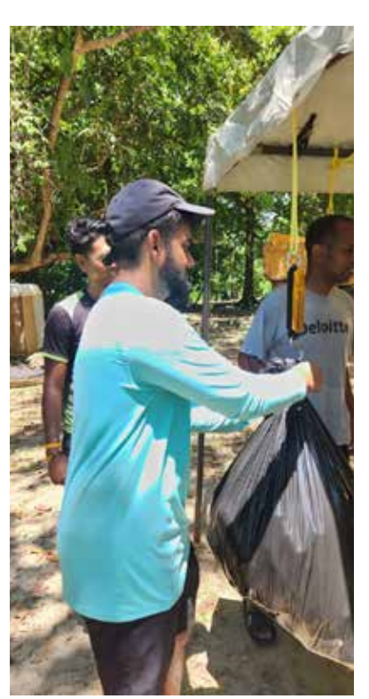
I.C.C.T.T. Balandra Beach