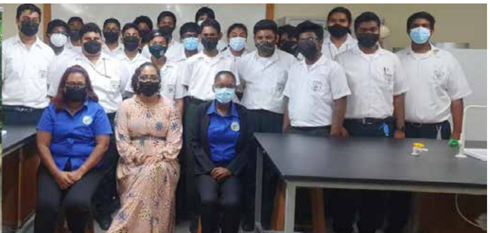
ASJA Boys' Charlieville, Bio-Sci Club and AARP Staff Members