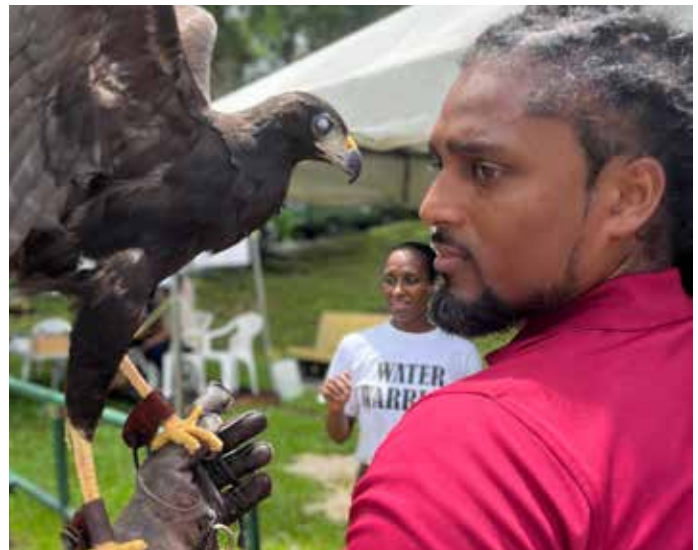
El Socorro Center for Wildlife Conservation