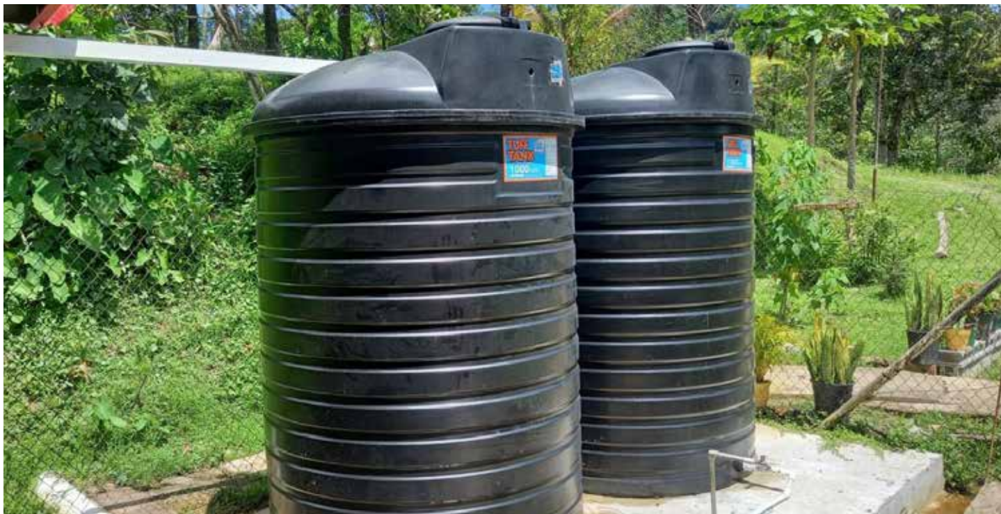
Rainwater Harvester installed at the Brasso Seco Community Centre

Brasso Seco, a remote village located in the Northern Range west of Matelot and east of Blanchisseuse, is known for its lush landscape dotted with rivers and waterfalls and is home to many bird and wildlife species. Agriculture is the main source of livelihood for many villagers and there is a budding cocoa and chocolate making cottage-industry. Although the village receives a pipe-borne water supply from the Brasso Seco intake, from time to time the community experiences challenges receiving potable water when the intake is damaged or filled with silt due to heavy rains.