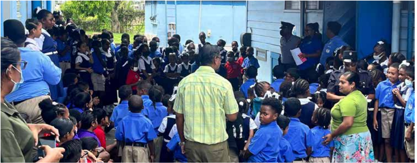
Arima Presbyterian Primary School

The Environmental Unit of the Arima Municipal Police (Arima Borough Corporation) has enlisted the support of the AARP in educating stakeholders in the borough on issues affecting our water resources and to help raise awareness in the Arima district about the effects of improper disposal of solid waste on the environment. In October, the AARP provided approximately