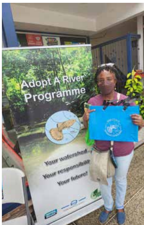
Massy Express, Maraval