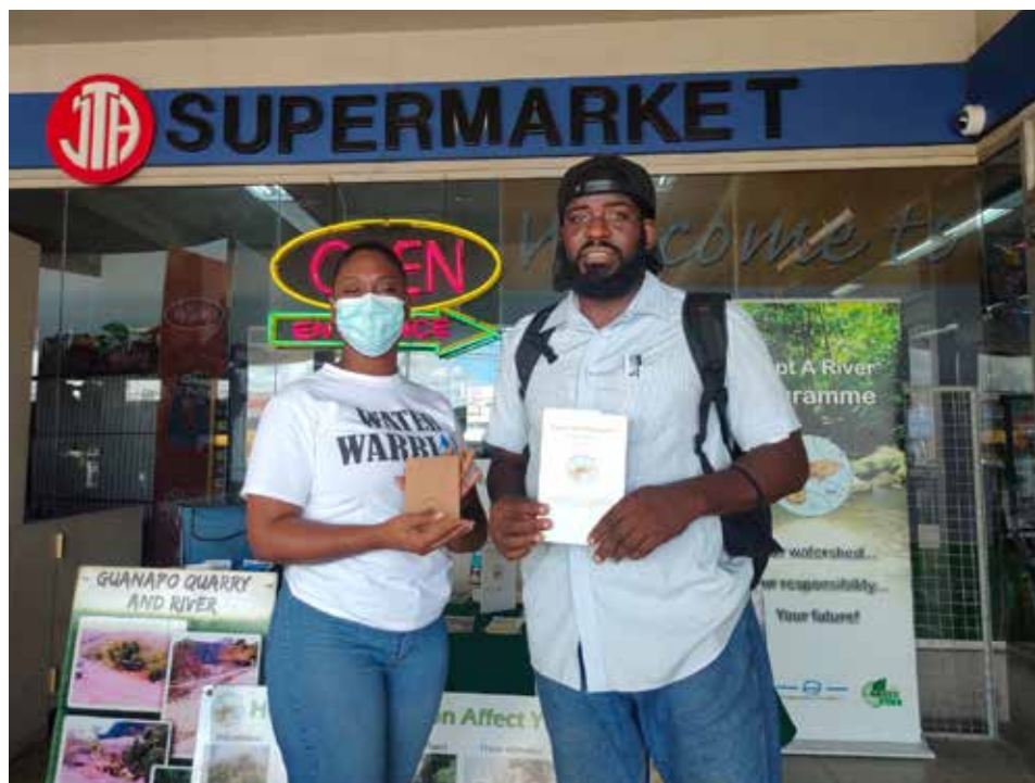
JTA Supermarket, Cross Crossing