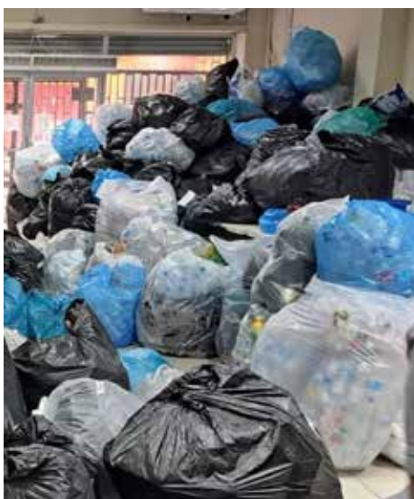
Recycling Centre at Charlotte Street

Join them and become a friend of the planet!