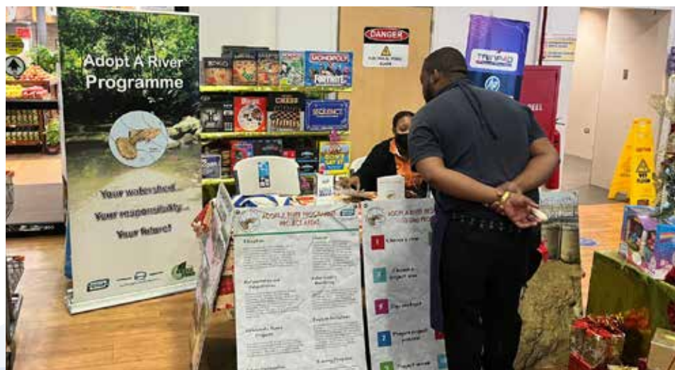
Massy Stores, Marabella