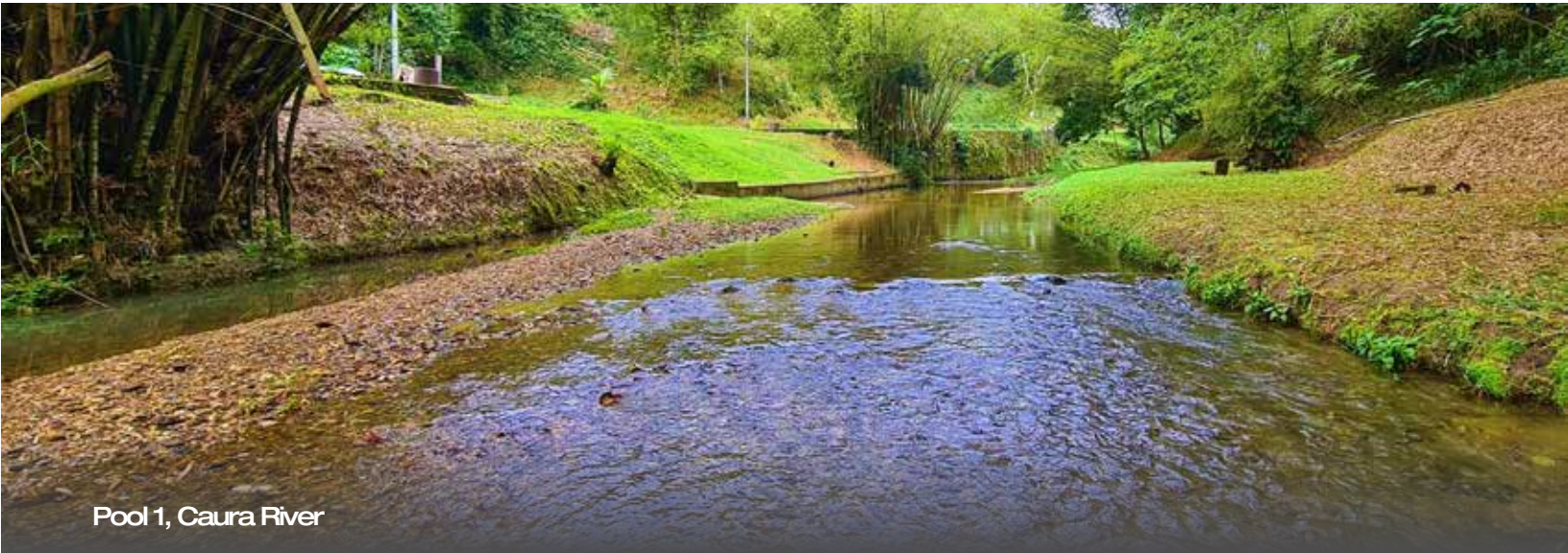
Pool 1, Caura River