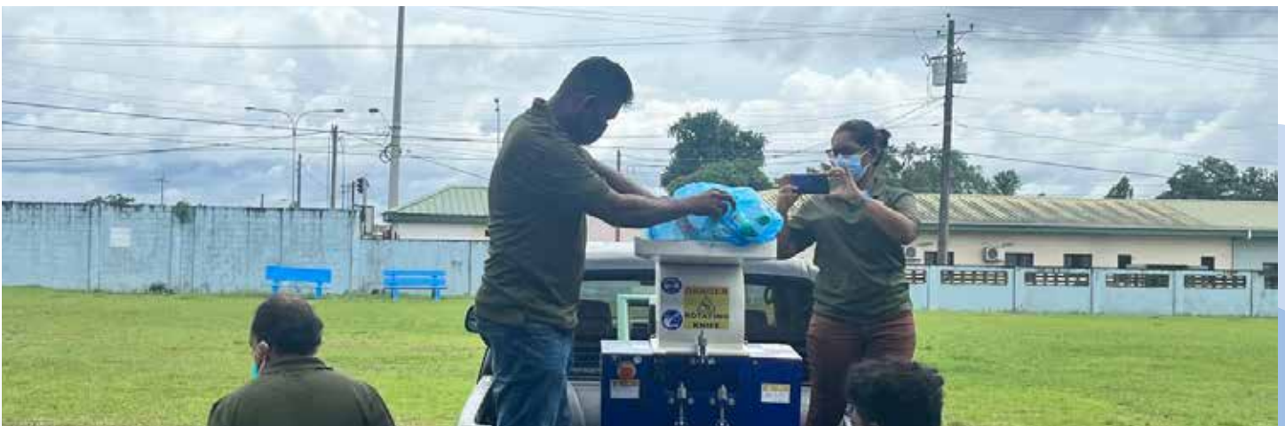
Flying Tree Environmental Management

November 9th was the first event of the partnership. At this outreach we engaged with the entire school population of approximately 265 students, 20 teachers and auxiliary staff members. Other groups supporting the Arima Municipal Police Environmental Unit at this event were the Flying Tree Environmental Management group and the ICare Project.