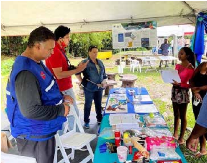
UNDP and ODPM