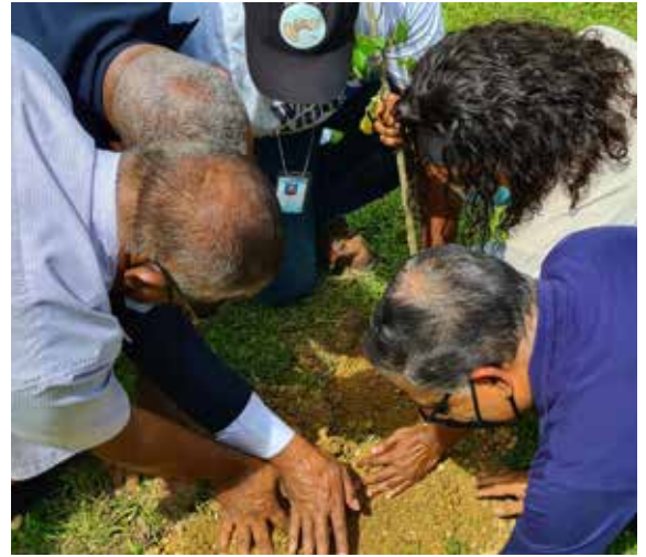
Saplings being planted on the University of the Southern Caribbean (USC) campus.

Trees and shrubs are an essential part of creating and maintaining healthy rivers and watersheds. Among their many benefits, trees help the soil to absorb and retain water, recharge ground water, reduce erosion and overland flow and can help to reduce the risk of flooding. They also release water vapours into the atmosphere