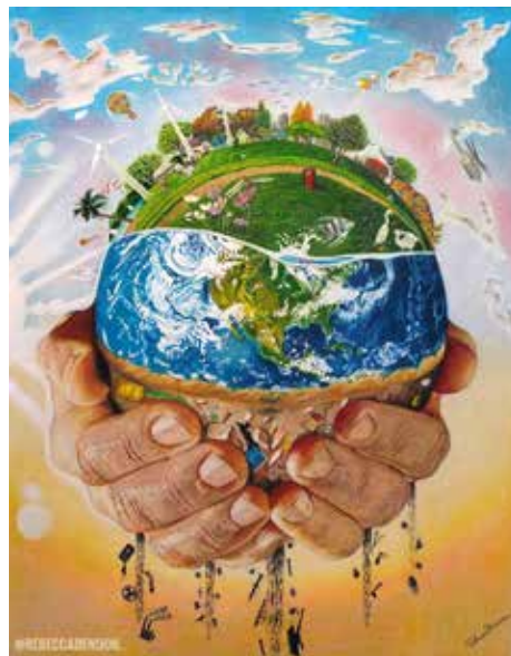
16 to 25 Winning Entry "Hope" Coloured pencils on stag blanc