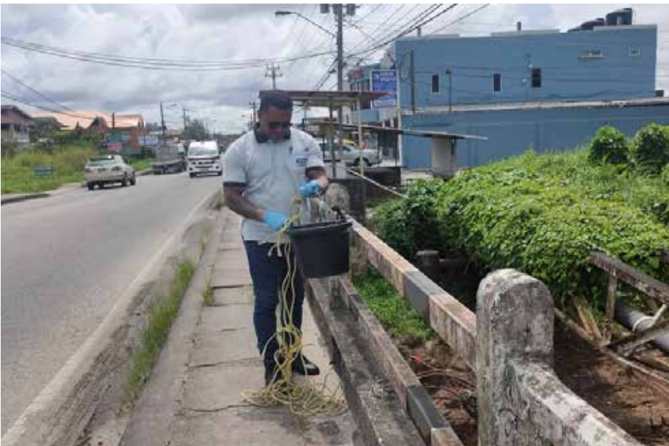
Collecting samples at Big Apple, Debe

We encourage other groups and communities to get involved by visiting our website adoptarivertt.com for more information on how you can partner with us in creating and maintaining healthier rivers.