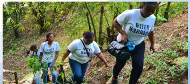
Members of the Adopt A River Implementation Unit participating in the Hike And Plant initiative.