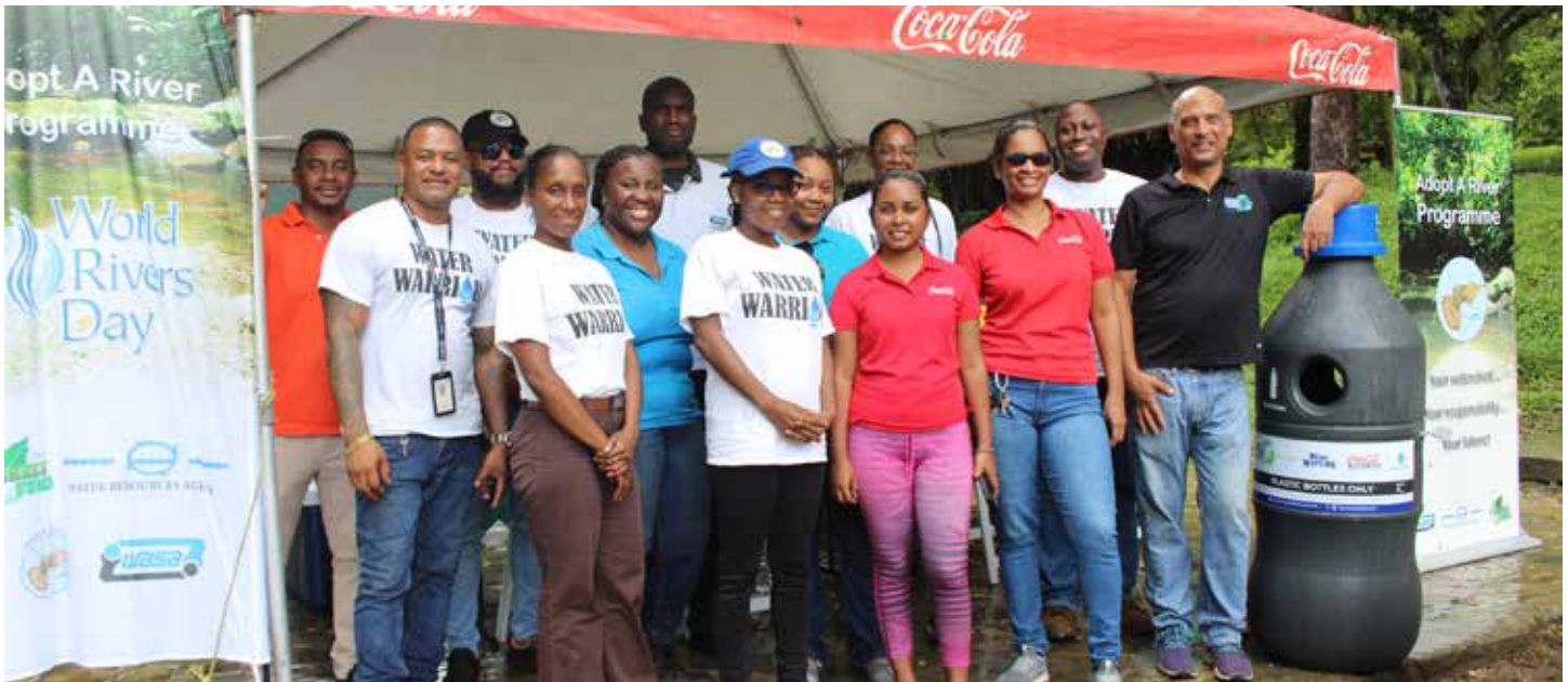
Adopt A River staff with partners from Caribbean Bottlers Ltd and the Every Bottle Back Initiative