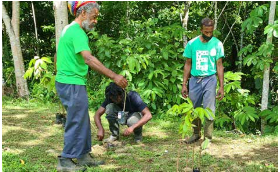
Caura Valley Foundation members planting trees on their premises.