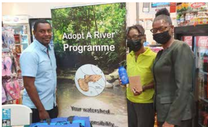
Tru Valu, Long Circular Mall

Topics covered included water pollution, water conservation, recycling and watershed protection. We thank our many partners and stakeholders for collaborating with us to serve their communities.