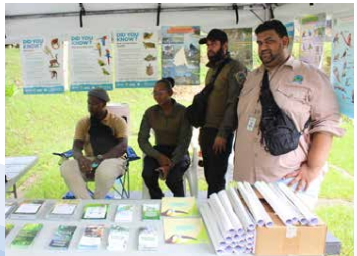
Wildlife Department, Forestry Division