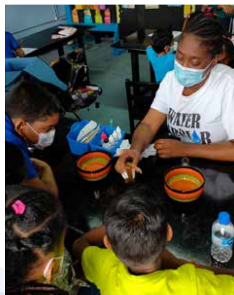
Bridge to Success Learning Academy, Penal