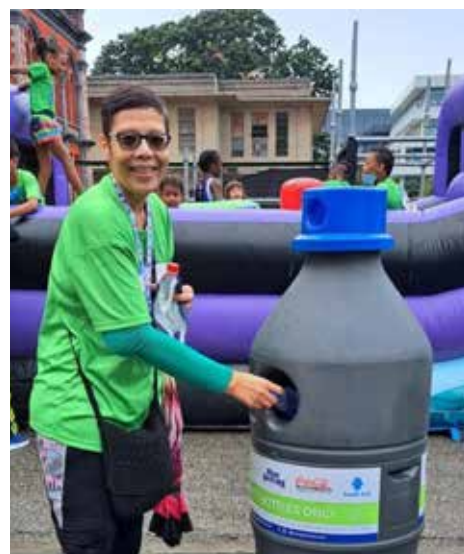
Patron recycling a bottle