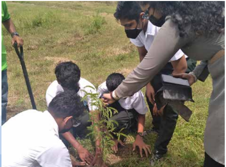
ASJA Boys' Charlieville, Bio-Sci Club planting on school grounds