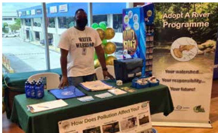
Massy SuperCentre, Trincity