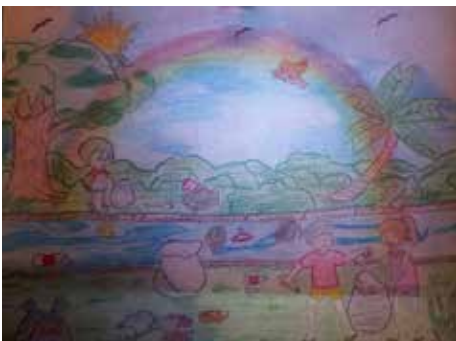
Under 15 & People's Choice Winning Entry Untitled Coloured pencils on paper