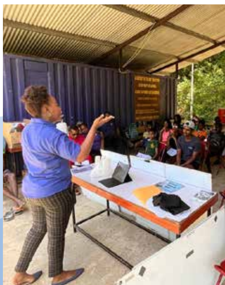
Scout National Vacation Camp, Santa Cruz