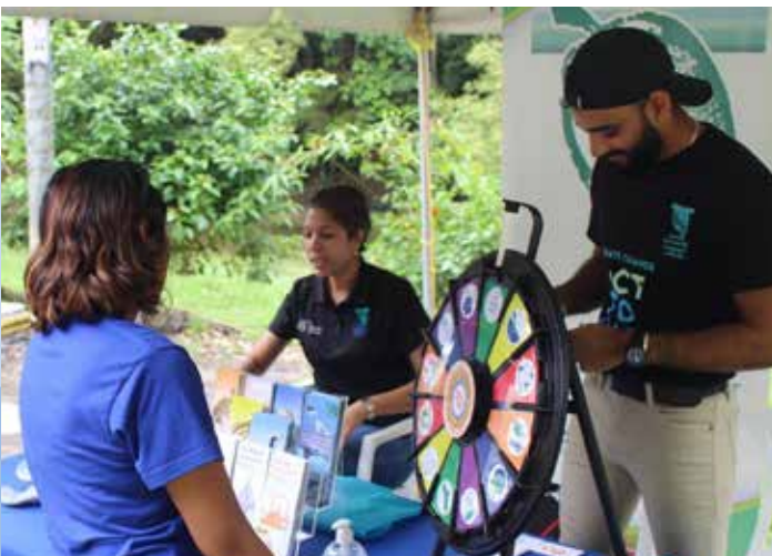
Environmental Management Authority