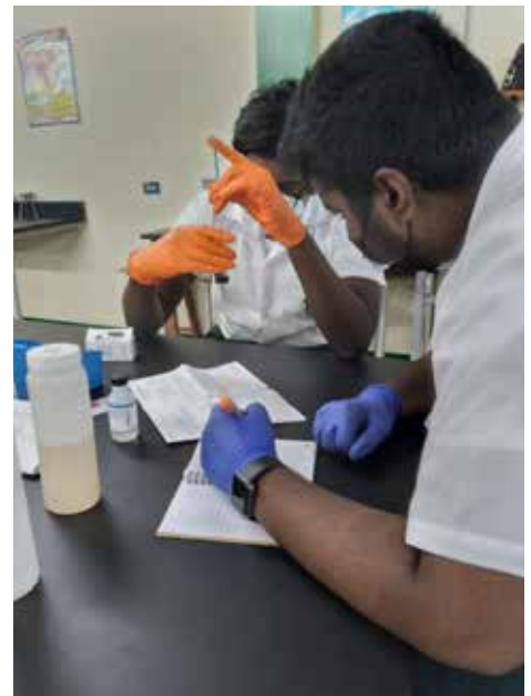
Bio-Sci Club testing water samples