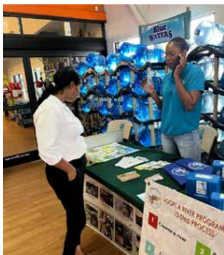
Massy Stores, Gulf View