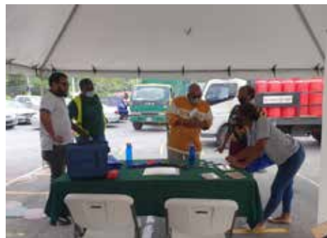
Massy Express, Maraval