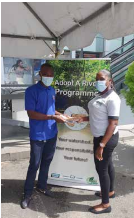
West Bees, Diego Martin