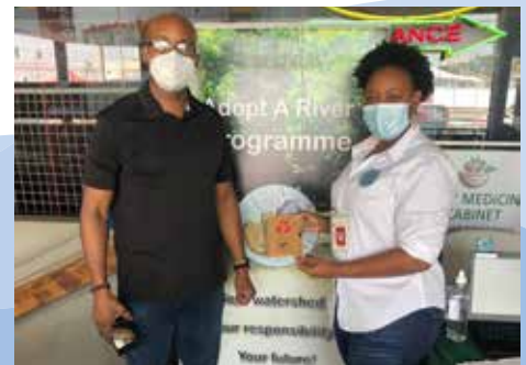
JTA, Cross Crossing