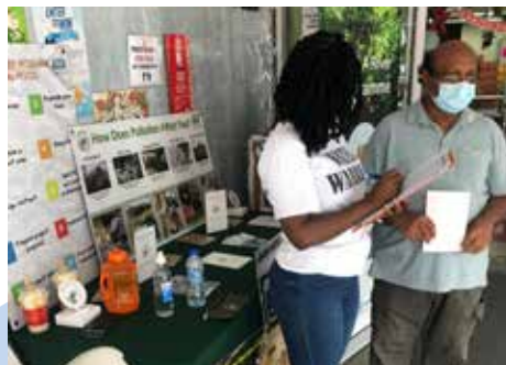
JTA, Carlton Centre