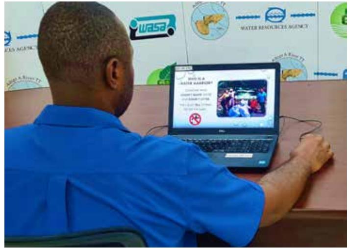
Online Class Session

Engaging our citizens and bringing awareness to the importance of all our watershed issues has remained an important aspect of the AARP's mandate. Where possible, outreaches and education and awareness activities were safely held physically at various locations and communities, and virtually through online interactions with several schools and community groups. We are grateful to our many partners and stakeholders for collaborating with us to serve their communities.