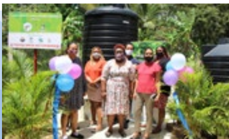
Principal and teachers of the school