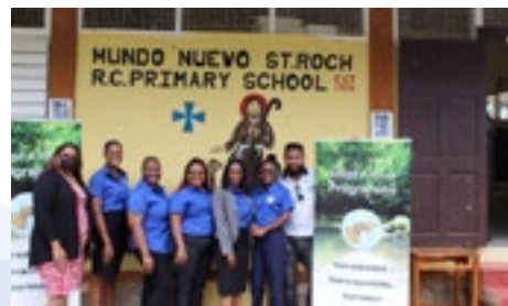
Epic Club representative and AARP Team