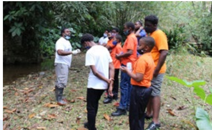
Training was also conducted with the Aripo Police Youth Club on January 30th and Dinsley/Trincity Police Youth Club on March 6th.

In conjunction with the trainings, AARP staff also conducted water monitoring exercises at various rivers within the watersheds both in Trinidad and Tobago. Some areas include Courland in Tobago; Talparo; Gran Chemin, Moruga; Maracas; Santa Cruz; Sangre Grande; Maraval and Diego Martin.