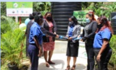
Ribbon Cutting for the RWH

The AARP installed a 1000g Rainwater Harvester (RWH) at the Mundo Nuevo Roman Catholic School, located at John Dillon Trace. The Programme was pleased to officially handover the RWH to the principal and teachers at the school on Monday 8th March 2021. It is the first of many that our Unit hope to install after consultation and assessment of other schools and communities throughout T&T.