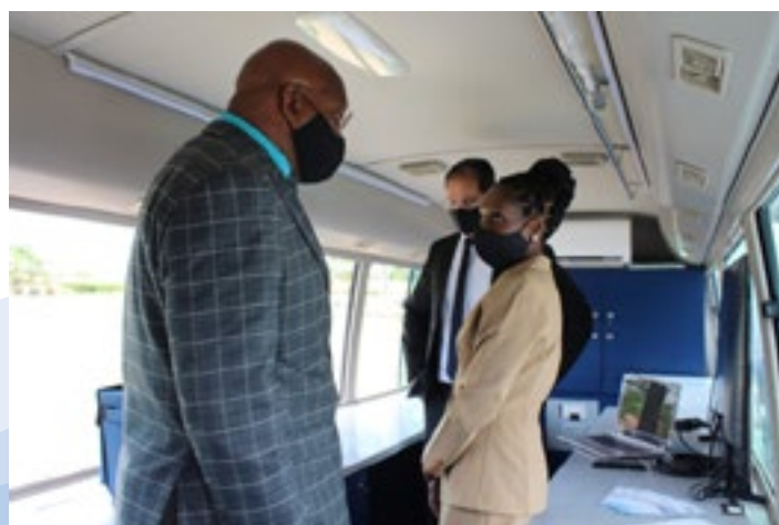
A look inside the Mobile Unit