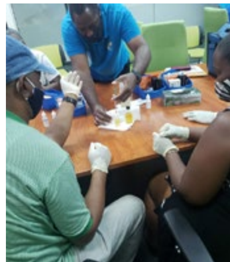
AARP Training Session with the Chaguaramas Development Authority