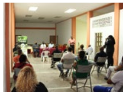
Members of the community