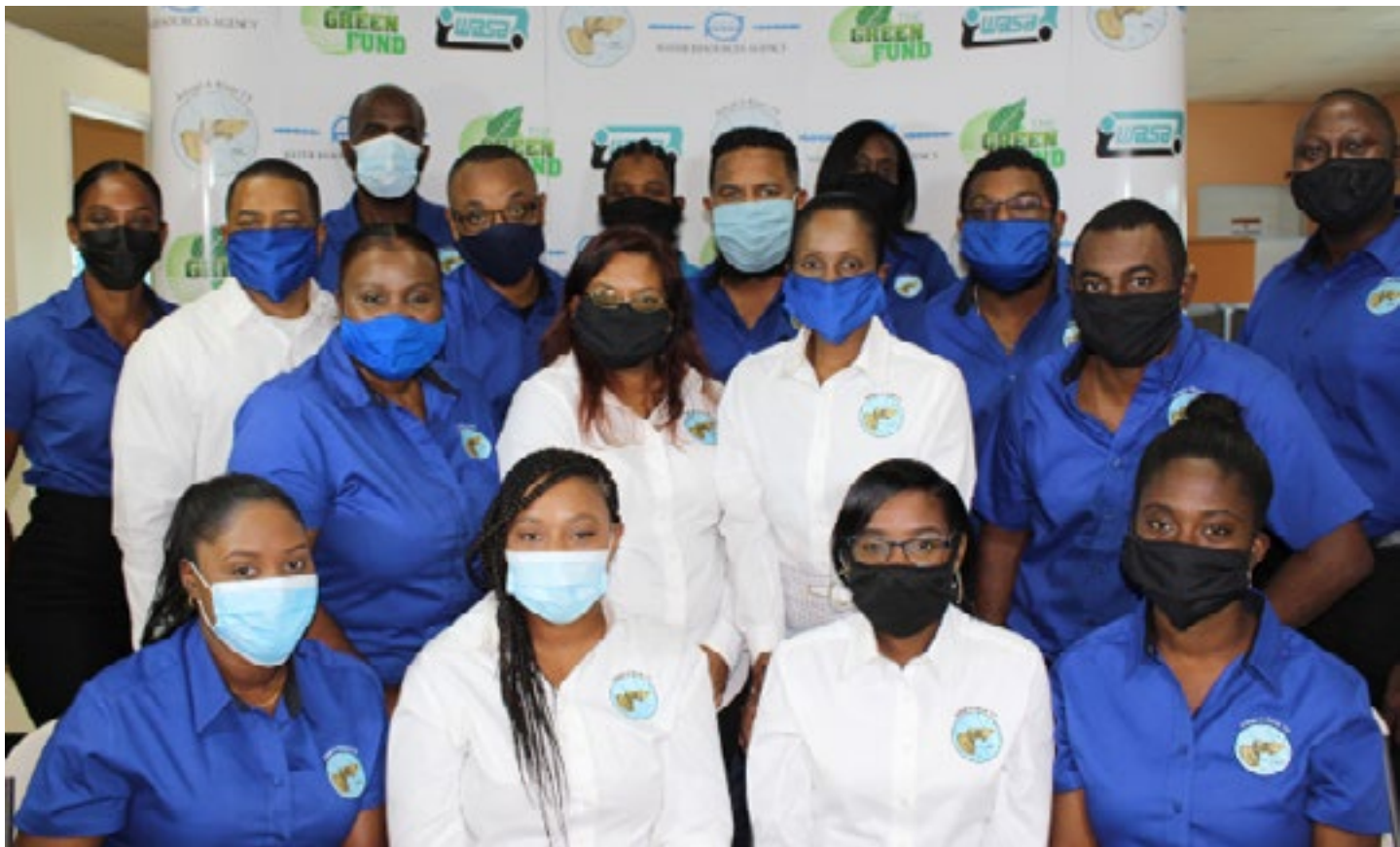
The Implementation Unit of the Adopt A River Programme

This year's Annual River Conference was held virtually for the first time, prompted by the ongoing Covid-19 pandemic which has necessitated that new and more innovative ways are sought to continue and enhance public engagement. This approach proved to be both challenging and exciting and was certainly a process of discovering and navigating new territory as the AARP plunged into the world of virtual gatherings.