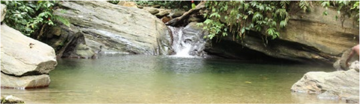
St. Joseph River

With the aim of creating the enabling environment for IWRM in Trinidad and Tobago a National IWRM Strategy was developed in 2000 followed by a National Integrated Water Resources Management Policy (NIWRMP) in 2005. The draft Policy was since revised in 2016 under the Water Sector Improvement initiative of the Ministry of Public Utilities. The intent of the existing NIWRMP is to unify the various initiatives related to water and provide a strong direction and vision for the effective management of the nation's water resources in an integrated and sustainable manner. Corresponding with the Policy, the Water Resources Agency developed an Integrated Water Resources Management Plan to address the specific challenges affecting water resources such as pollution and water treatment issues. Some corrective actions identified by the Plan included: