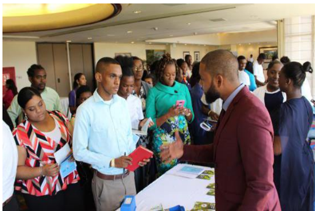
One of the Networking Sessions conducted during the Conference