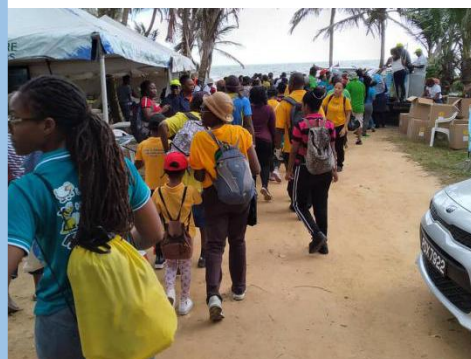
Volunteers came out in their numbers to participate in the Matura Beach Clean Up in March