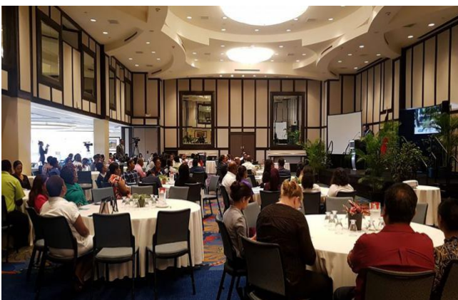
Attendees at the Conference seated in the Ballroom of the Trinidad Hilton