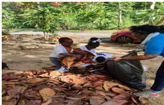
Volunteers at the Blue Basin River clean up on the morning of Saturday 8 th February

The members of the AARP conduct outreaches to various communities throughout Trinidad and Tobago. It is a critical and necessary step in highlighting the mandate of the AARP which is to initiate awareness of our watersheds, facilitate monitoring and water testing, as well organise and encourage collaborative clean up campaigns which enhances and preserves the rivers in our beautiful Twin Islands.