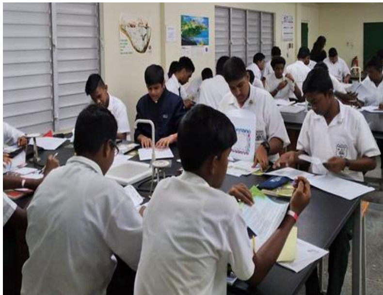
Water Warriors Youth Training Session in progress at ASJA Boys' College, Charlieville back in March. Session conducted by members of the AARP

This training is usually the first step in developing projects and further activities and initiatives existing in some communities, all aimed at finding solutions to improving the status of our watersheds. With this premise in mind, a training session was conducted in March with thirty-eight (38) members of the BioSci Club at ASJA Boys' College Charlieville. Comprising Form One to Upper Six students.