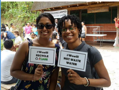
Visitors at The Green Market proudly displaying Adopt A River Signs